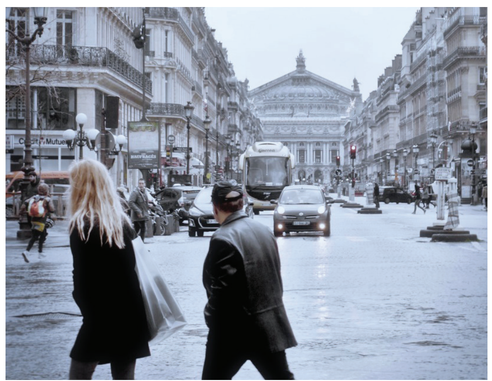
Photo-powered "urban diaries" can give residents a powerful new way to contribute to the dialogue that shapes their cities.